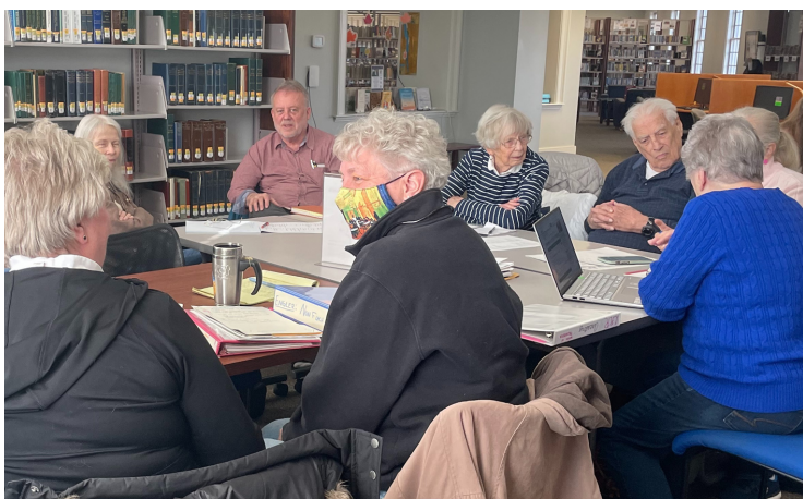
Genealogy Research Roundtable