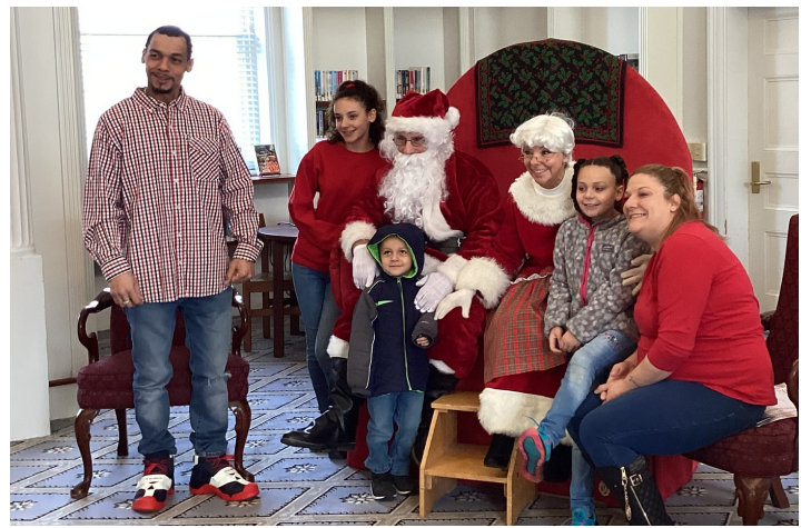
Mingle with Kringle